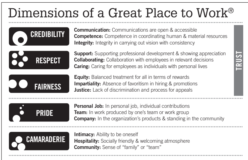
Figure 1.1 The Great Place to Work Model

Specifically, he identified the relationships between employees and their leaders, between employees and their jobs, and between employees and each other as the indicators of a great place to work. Relationships at work matter, and in particular, the centrality of these three relationships influenced people's loyalty, commitment, and willingness to contribute to organizational goals and priorities. If leaders implemented practices and created programs and policies that contributed to these three relationships, employees had a great workplace experience. It mattered less what the programs, policies, and practices were, and more that they were done in a way that strengthened relationships. The Great Place to Work Model (see Figure 1.1) was developed during this time by the Institute's founders, Robert Levering and Amy Lyman. The Model was later formalized and today has five dimensions, which form the core chapters of this book: Credibility, Respect, Fairness (which, put together, comprise Trust); Pride; and Camaraderie.